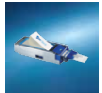
Tool free reports prints automatically