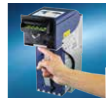
Choose your report and press validator head's lever