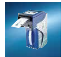
Feed Ticket into validator