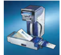
Connect CashCode one™ validator and TITO printer