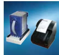
Cashbox is docked on one of four stations