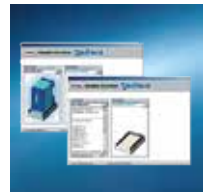
oneTrack™ Soft Count software interface